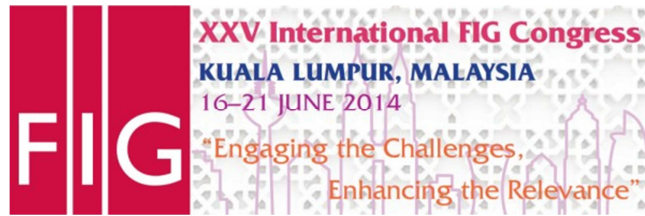
FIG Congress 2014 – register before deadline 30 April 2014 - detailed program is published

www.fig.net/admin/ga/2014/ga_agenda_2014_full_excl_bids.pdf